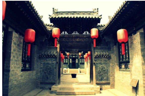
Qiao Family Courtyard

Morning transfer to Taiyuan, on route visit Qiao Family Courtyard , about a quarter the size of the Wang Family Courtyard that you visited yesterday. Film fans may notice this place at being from Raise the Red Lantern , a film set in the 1920s starring Gong Li. Housing over 300 rooms, considered by many architects to be one of the finest examples of great private residences northern China.