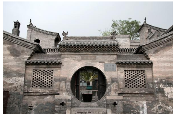
Wang Family Courtyard

Tour begins with the Wang Family Courtyard , near Lingshi Town; explore over 50 courtyards and 1000 rooms, one of the largest residential complexes built by Shanxi merchants. Beautiful carvings can be found, stone, brick and wood designs are in abundance here. Paintings, calligraphy and Qing dynasty furniture are also housed here; all can be peacefully enjoyed while learning of the family that used this place since the 1600s.